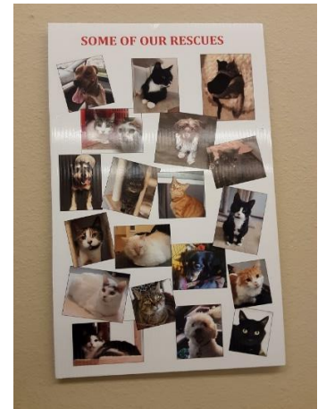
Pet Advocacy Program