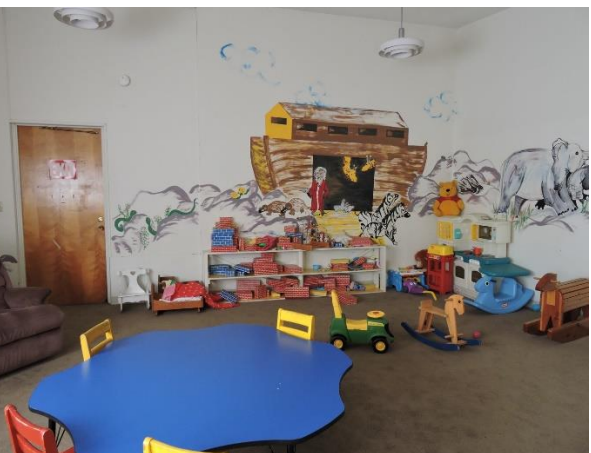
CATS Room ~ Children's Ministries