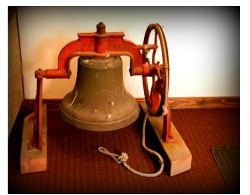
1882 ~ Church bell