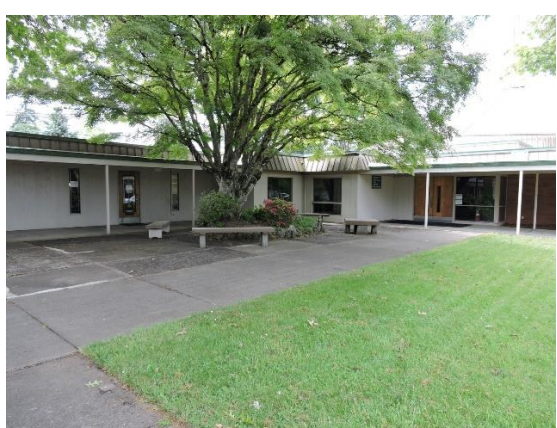
Breezeway Classrooms ~ Partners use