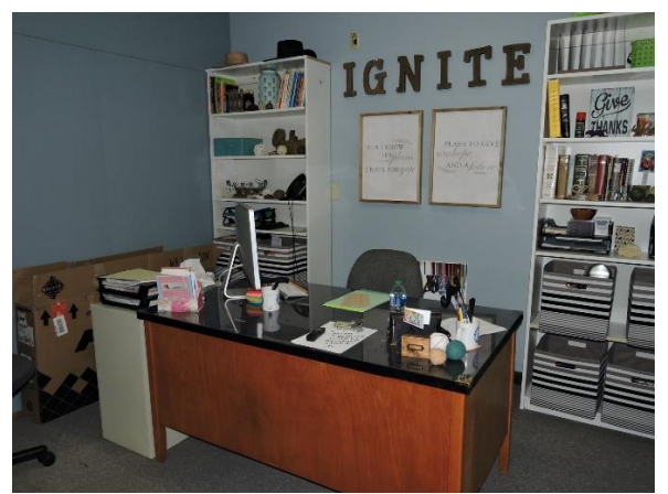
Youth Coordinator Office