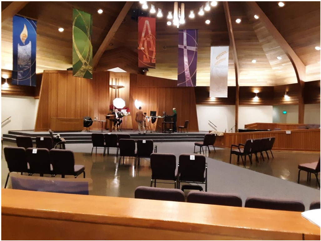
Worship Center~ In person worship with safety protocol