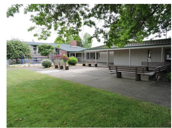
Fellowship Center ~ Centro Cristiano Familiar Congregation