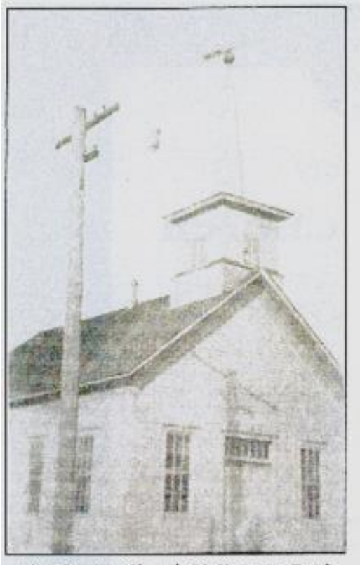
trinat Baptist Church McKenzie's Ford