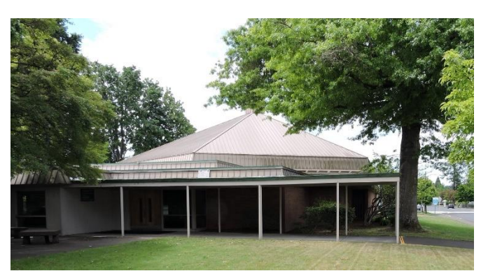
Outside – Worship Center