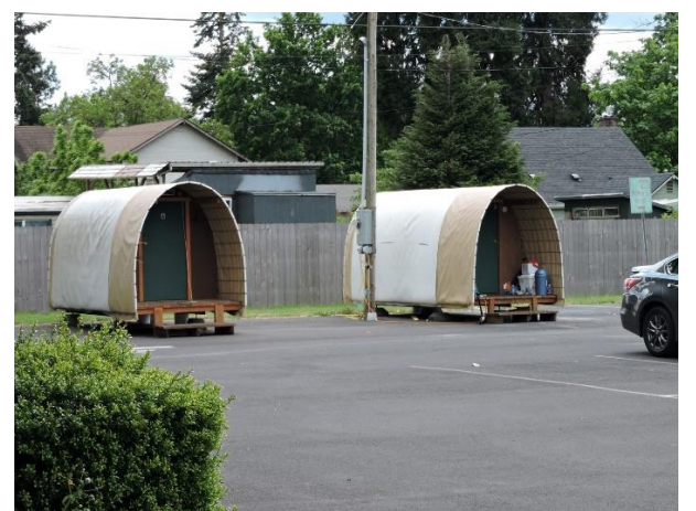
Conestoga Huts ~ Transitional Housing